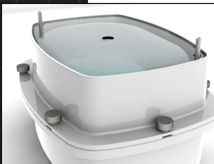
Islet Shipping Container