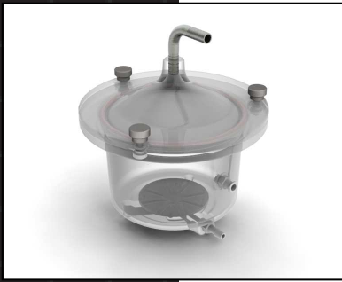
Disposable Ricordi Chamber