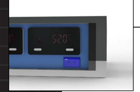
Large LCD Display